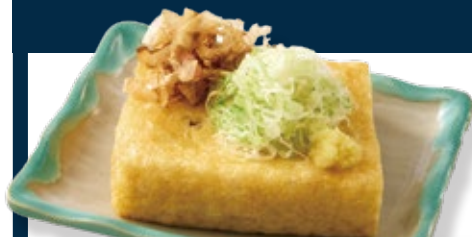
73 Deep-fried Tofu (Tochio Specialty) Half ¥455 (¥500 tax included)