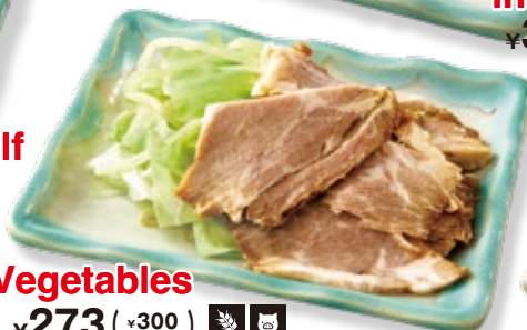
78 Large Serving Roast Pork & Vegetables