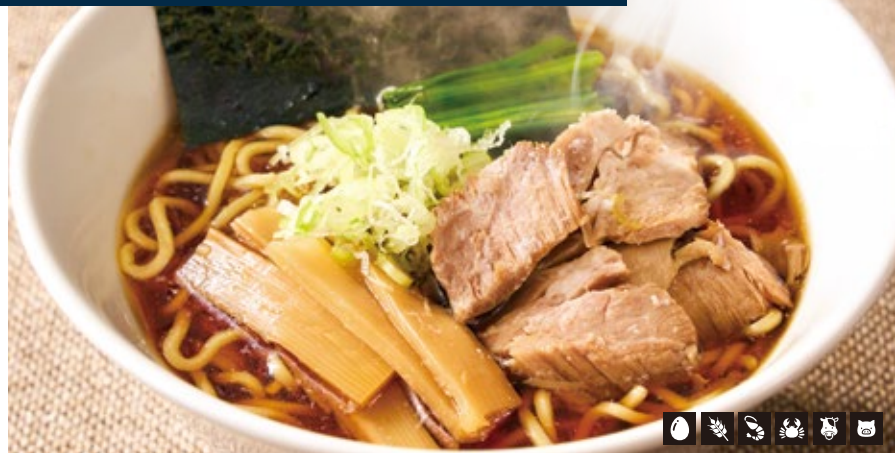
53 Nagaoka Ginger Soy Sauce Ramen ¥1,455 (¥1,600 tax included)

The hidden ramen kingdom! The three major ramens that represent Niigata.