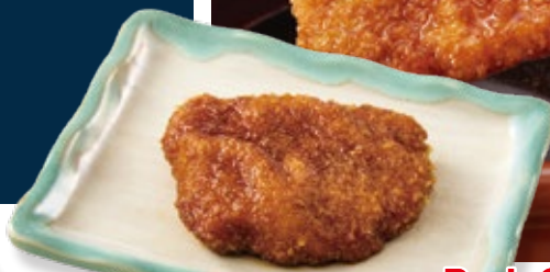
71 Pork Cutlet Dipped in Sauce(1) ¥364 (¥400 tax included)