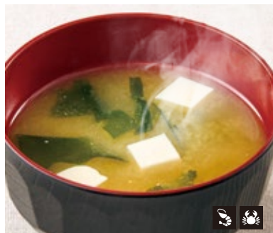
76 Miso Soup