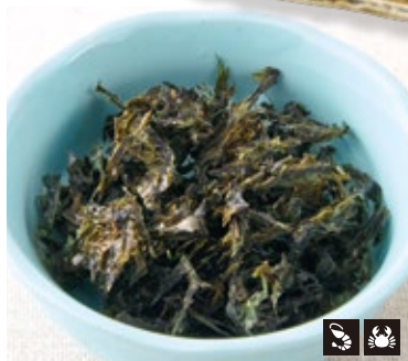
79 Rock Laver