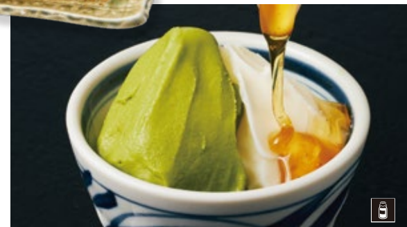
80 Rich Milk and Kyoto Uji Matcha Gelato (with Honey from Niigata)