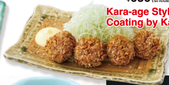
Kara-age Style Deep-fried Chicken, Coating by Kakinotane