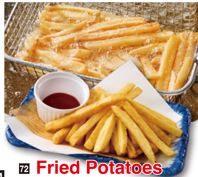
72 Fried Potatoes