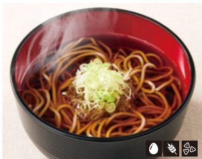
77 Soba(Hot) Small